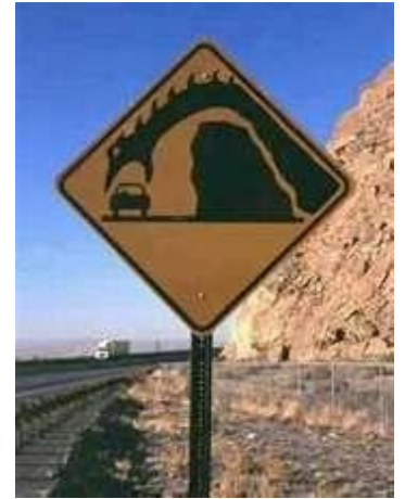
Watch where you drive!