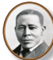
William Still was called the Father of the Underground Railroad.

Station Master: a person who hid escaping slaves in his home.