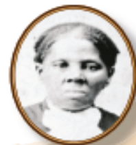
Harriet Tubman, one of the most famous conductors, was known as the "Moses" of the Underground Railroad.