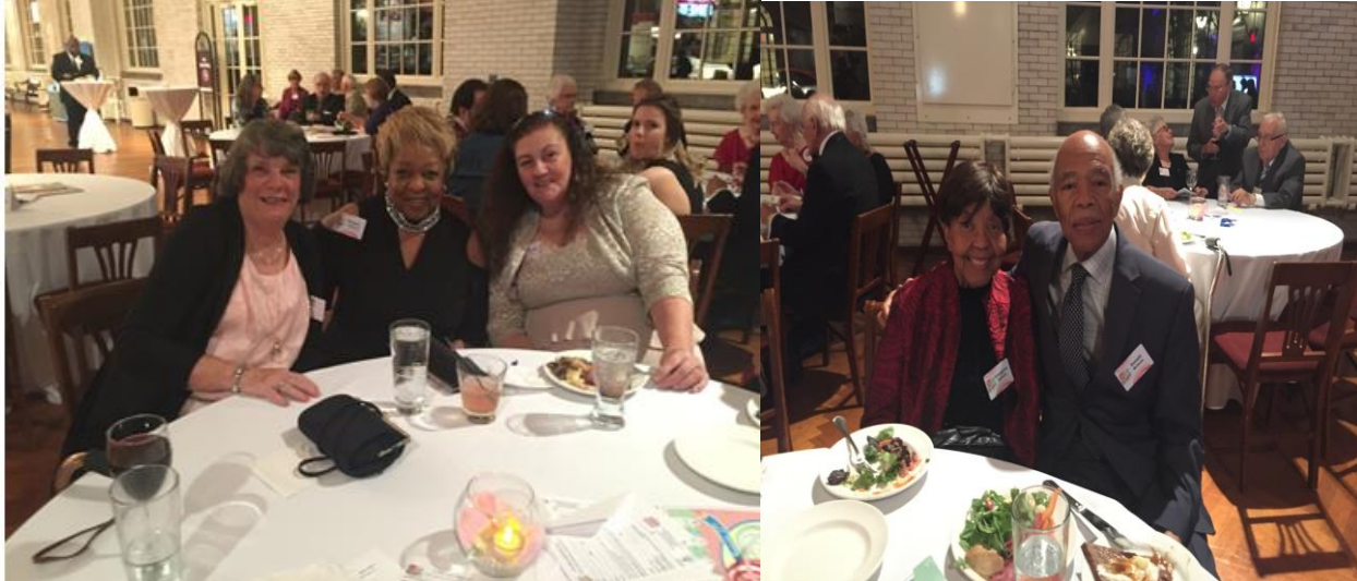
PVM GALA 2017