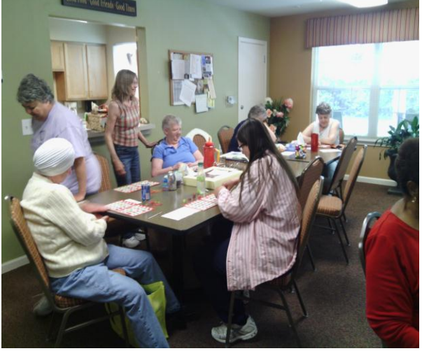
Residents play Grocery Bingo.